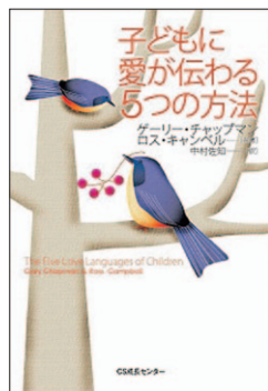
Book Review: The Five Love Languages of Children

Good for showing along with its twin production "Unlocking the Mystery of Life".