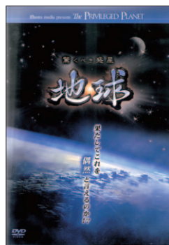
DVD Released in Japanese "The Privileged Planet"

"The nurse told me that most AIDS patients don't have any visitors. However, in contrast, people from the church came to visit me every day. By the grace of God I never felt lonely even after they left to go home. The Lord taught me the privilege of prayer, too and I prayed for all who came to visit me at the hospital "sending them back out" with a blessing on their life and witness..."